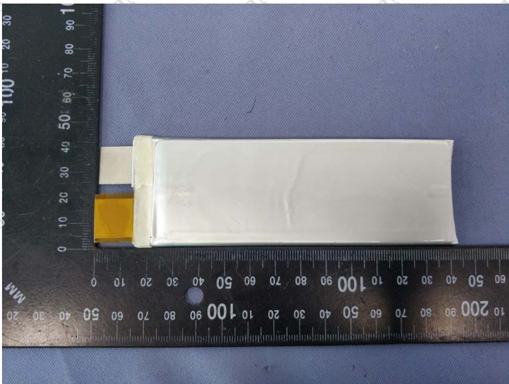
Figure 4 Overall view of cell (电芯图)