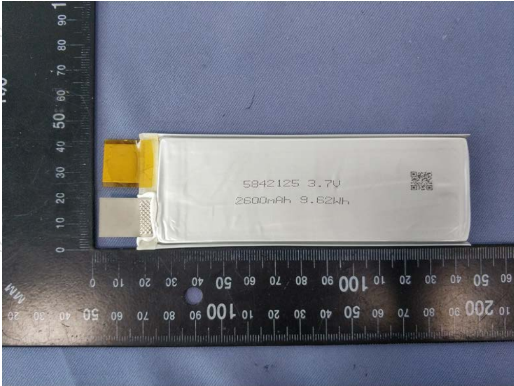
Figure 3 Internal view of battery (内部结构图)