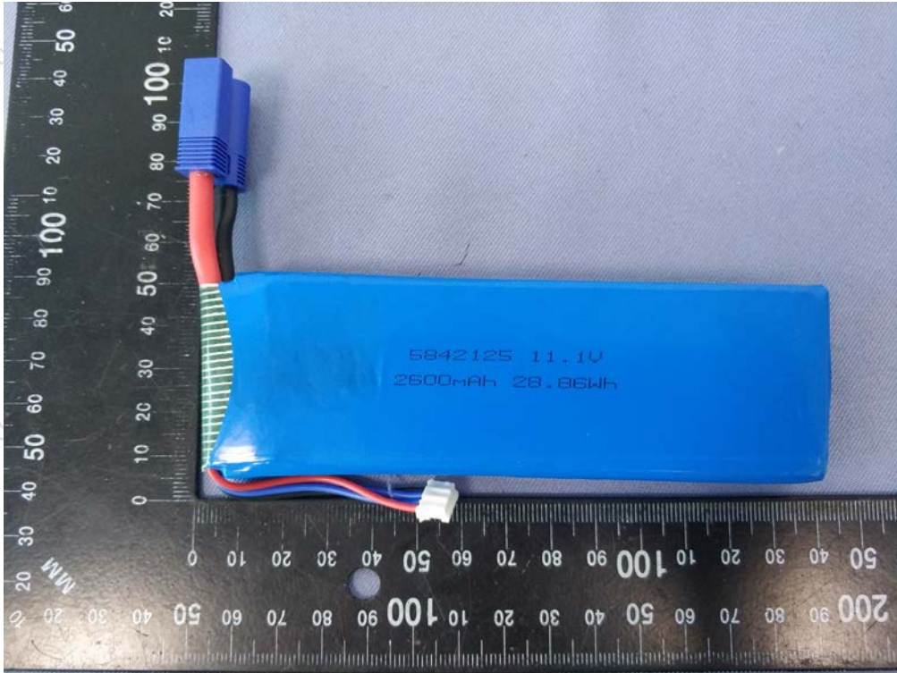
Figure 1 Overall view I of cell (外观图I)