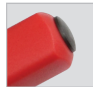
Metal Striking Cap